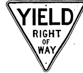
R-39 30" sides (black on yellow)

The YIELD RIGHT OF WAY sign shall be an equilateral triangle with one point downward, having a yellow background with black lettering. Its sides shall be a minimum of 30 inches in length. It shall be reflectorized or illuminated. It shall be located and erected in the same manner as the Stop sign (sec. 31).